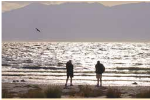
The Salton Sea

Typical of the Colorado Desert area, average low and high temperatures in spring and fall range from about 50 to 85 degrees. July and August are the hottest months, with 75-degree mornings and afternoons well over 100 degrees. Winter days average 60 degrees, but nights can drop to freezing.