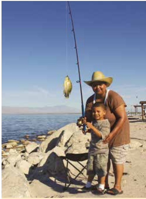
Fishing is popular at the Salton Sea.

The Salton Sea presently supports a significant number of threatened or endangered bird populations. With nearly 95 percent of California's wetlands converted