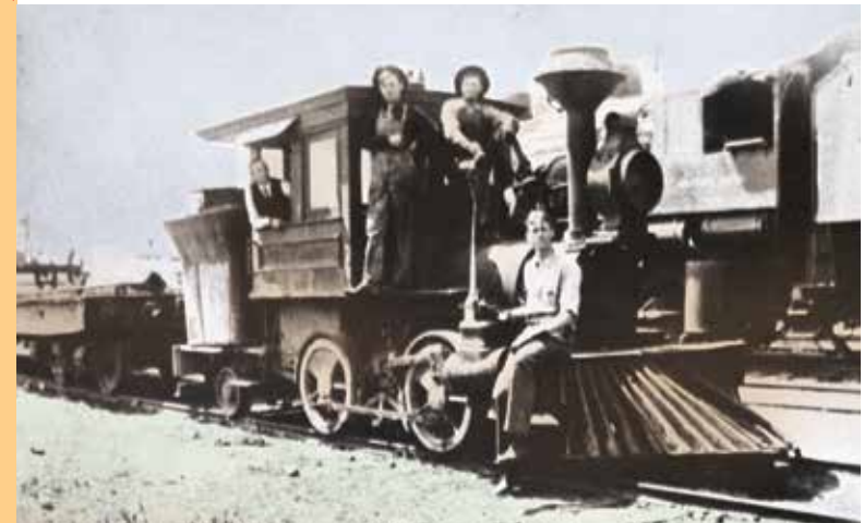
New Liverpool Salt Company train, ca. 1895

The Salton Sink basin was originally part of what is now the Gulf of California. Flowing from the Rocky Mountains to the gulf, the Colorado River scoured out the formations of Arizona's Grand Canyon. In wet times, the river would fill the sink; at other times, it would bypass the sink, causing the lake to shrink or even to disappear.