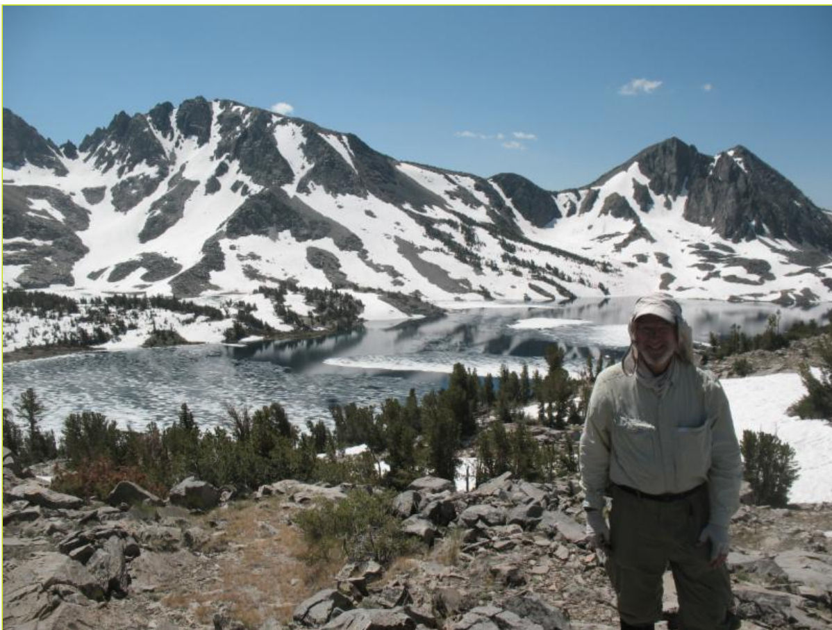
Duck Pass Lake from Duck Pass, July 14, 2017