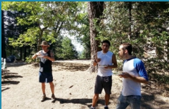
Dogwood Camp Ground

Reserve your spot early for our upcoming overnight events. Click on the names of the events to see full details.