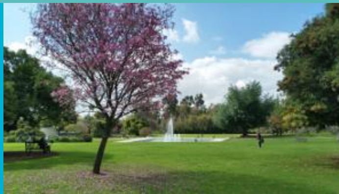
Los Angeles County Arboretum, March 24, 2018

Come and Join Us on the first Tuesday of the Month from 7:00 to 8:30 PM.